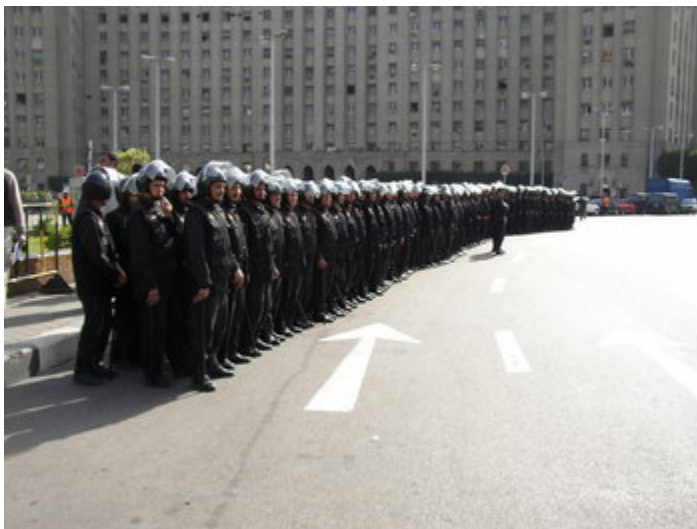
Egypt Police State 2.jpg